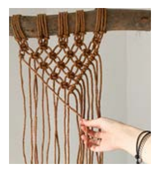
STEP 7: Do the same for the other side. This time on the 10 cords to the right, ending on the cord that was the lead cord in step 6.