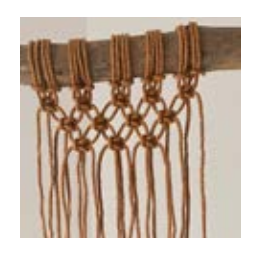
STEP 5: For the next rows, leave two more ropes apart and continue making square knots. The 4th row has 2 square knots, and the 5th row has 1 square knot.