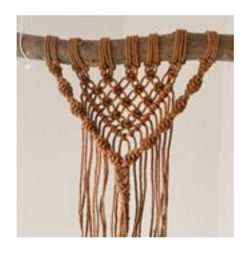
STEP 12: Unravel the rope's ends, with the help of the comb, brush them and cut them in the form of a "V". Cut a piece of rope that's 1m. Tie each end of the cord to the two sides of the wooden dowel to hang our macrame project.