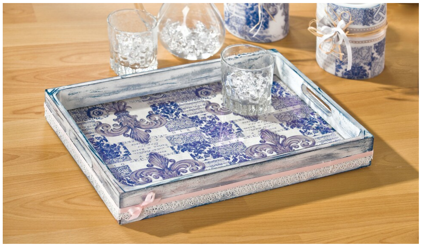
Here's how it works

With Napkin technique within a short time the simple tray becomes a unique unicum.