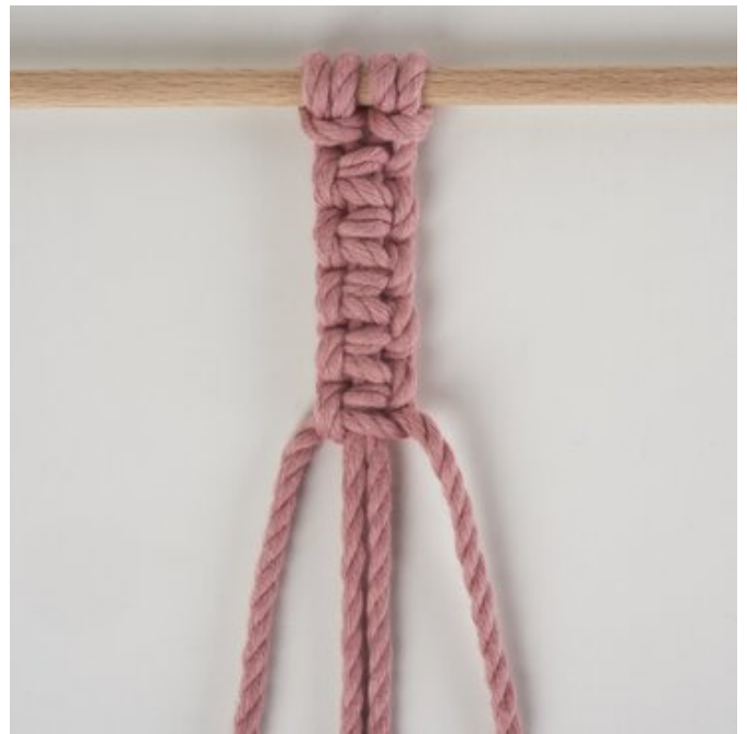
Square knot - facing right