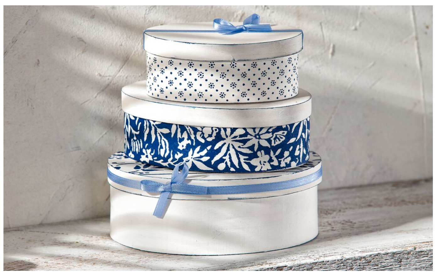
And so it goes

With little effort you can create these pretty chip boxes. The borders are already completely Napkin contained in the and must be stuck only on. Small bows Satin ribbon complete the look.