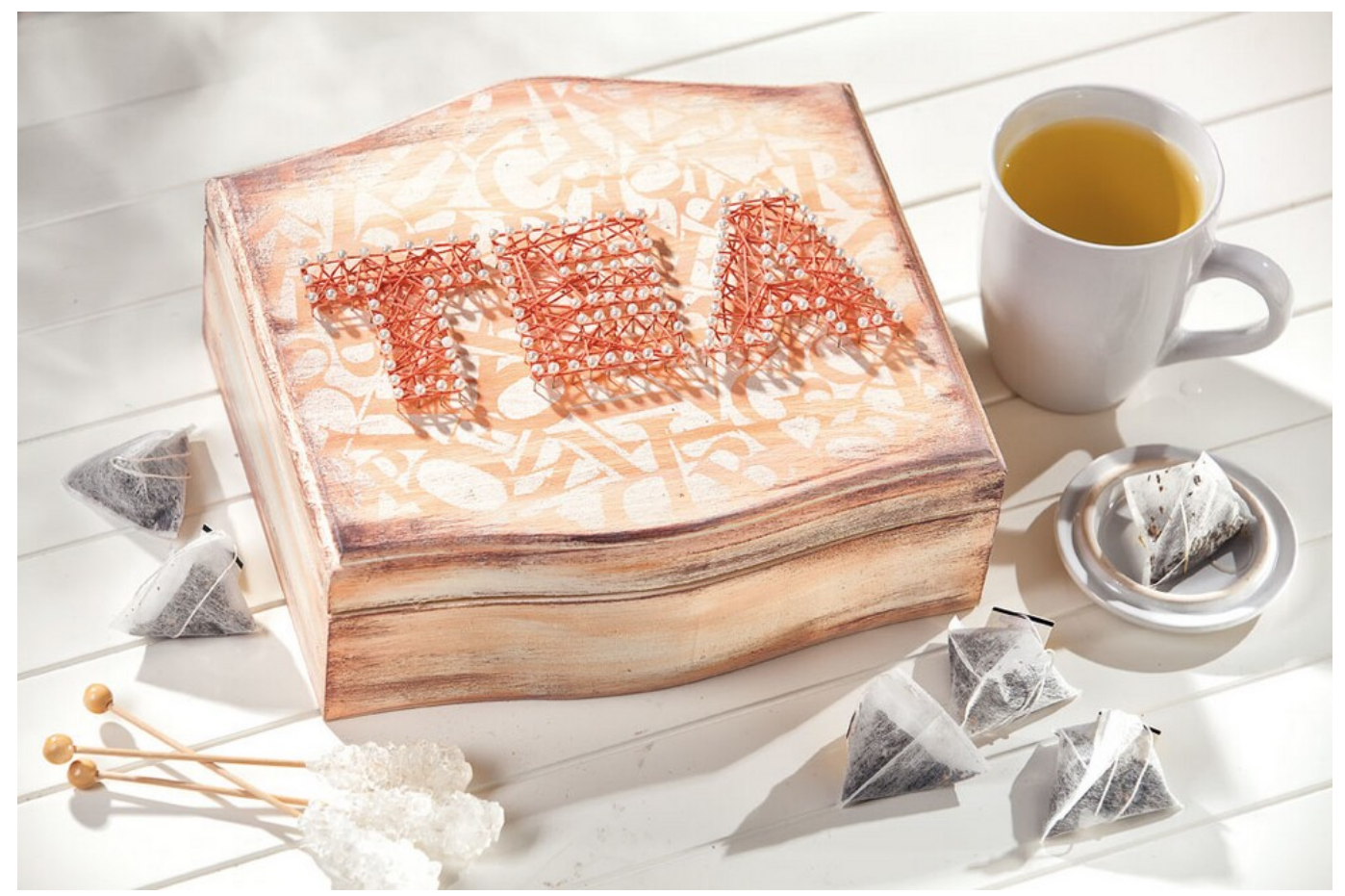
Here's how it works

With this beautiful tea box you can see immediately what is in it. The word "TEA" is placed over the stencilled motif with a large thread tension graphic - with simply Embroidery twist criss-crossing within the contours of the decorative-Needles.