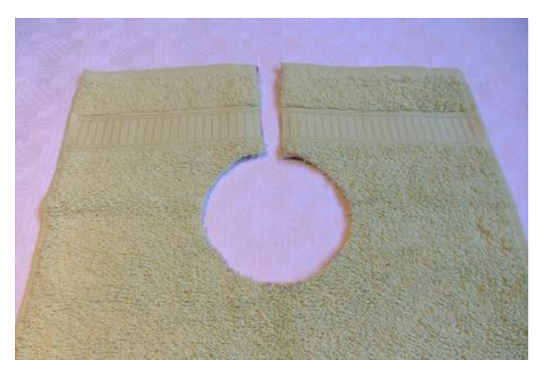
Step 2 - Attach Bias Tape

Now it gets a bit tricky, but don't worry, with good preparation, everything is doable! Open the bias tape in the middle and place it around the raw edge of the towel. Make sure the tape fits snugly to ensure that you catch all fabric layers when sewing. Secure everything with "Wonder Clips" or pins at short intervals. Sew the bias tape along the edge with a straight stitch, work slowly, and adjust the position of the bias tape if necessary. If you find that not all fabric layers are stitched, just sew over the affected areas again.