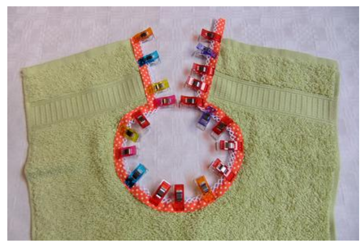
Step 3 - Attach Snaps

Your bib now needs a practical closure. Snaps are an excellent choice as they are easy to attach and available in many colors and shapes. Determine the optimal position for the snaps. Attach them with a special snap plier. Alternatively, you can use velcro.