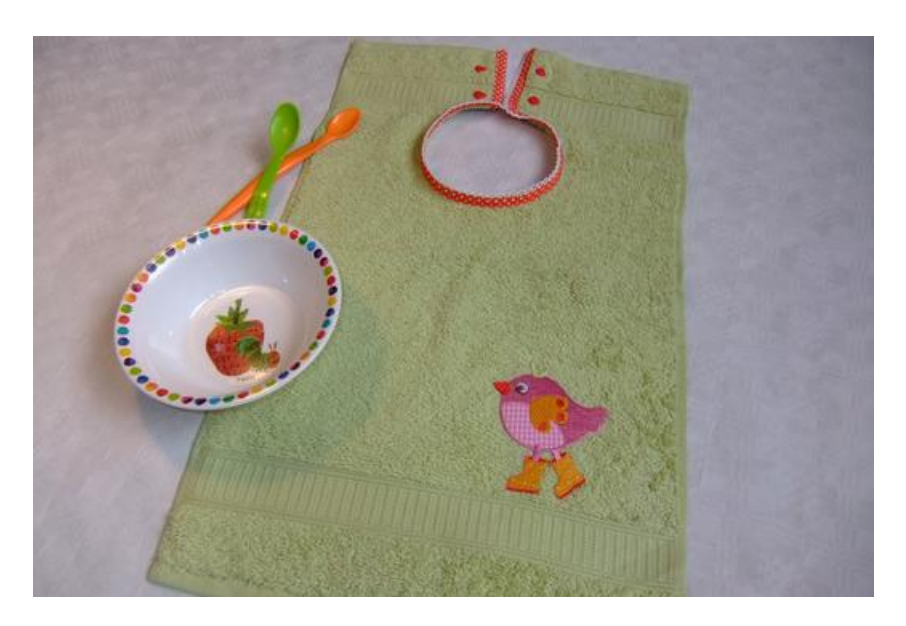
Enjoy recreating it > If you liked this guide and need the materials for it, visit our online shop. There you will find everything you need to get started!