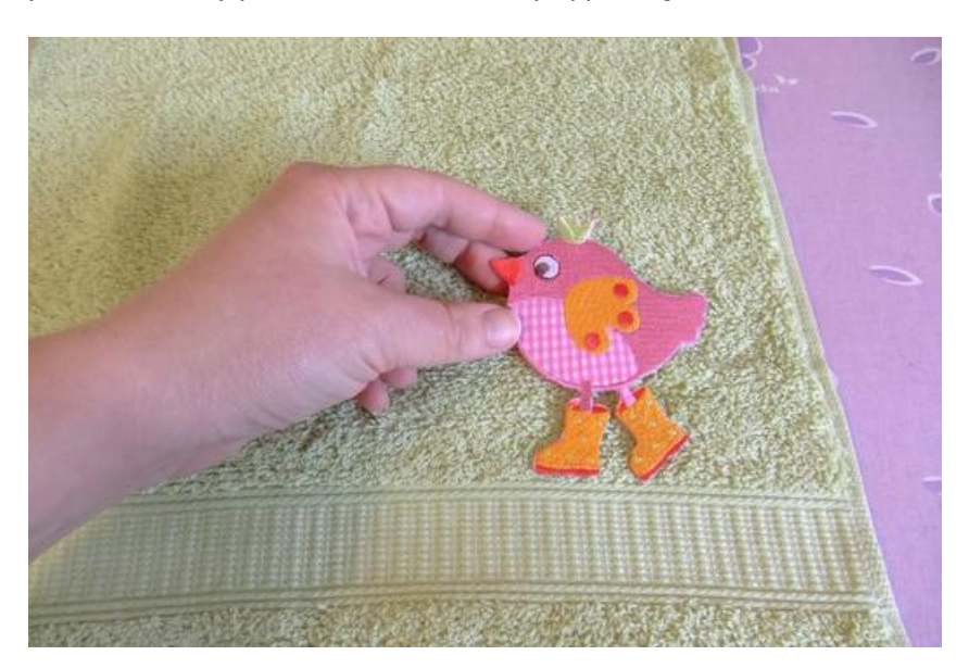
Now you can proudly present your homemade bib, ready for exciting food adventures!

Your bib is almost done! To give it a personal touch, you can iron on any applique. Find a nice spot for it (for example, along the woven stripe of the towel), place a damp cloth over it, and iron for about 60 seconds on the cotton setting. This will make your bib not only practical but also visually appealing.