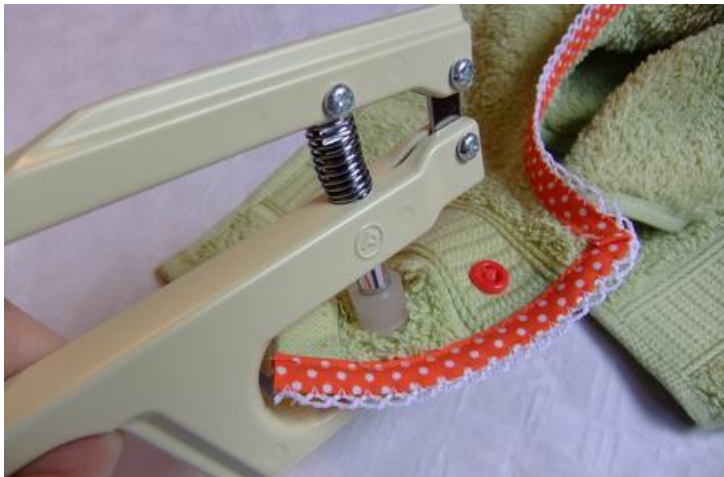
Step 4 - Iron on Appliques

Your bib is almost done! To give it a personal touch, you can iron on any applique. Find a nice spot for it (for example, along the woven stripe of the towel), place a damp cloth over it, and iron for about 60 seconds on the cotton setting. This will make your bib not only practical but also visually appealing.