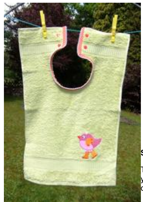
Step 1 - Marking and Cutting

Do you have a little one and are looking for a creative activity? Sew your own bib – practical and stylish at the same time! In this guide, we'll show you how to create an enchanting bib from a guest towel using simple materials you might already have at home. It will be large enough to catch even the wildest food battles while providing a cute accessory for your table. So grab your needle and thread, and let's get started!