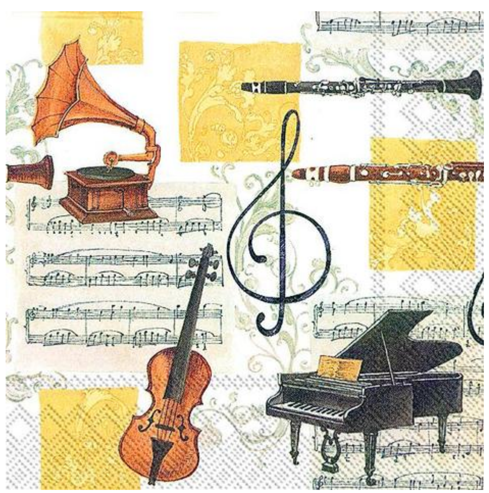
The Napkin "Musica Classica" is perfectly suited to recreate this idea.

The drawers of these large cube boxes offer an enormous amount of storage space, the surfaces offer plenty of room for creative design. Here napkin motifs are combined with stencilled notes to form a harmonious ensemble.