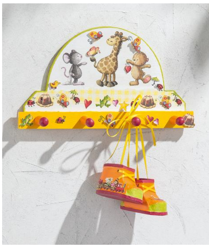
This idea is timelessly beautiful!

The small children's wardrobe is decorated with funny napkin motifs and cheerful colours. So keeping things tidy is fun even for the smallest ones.