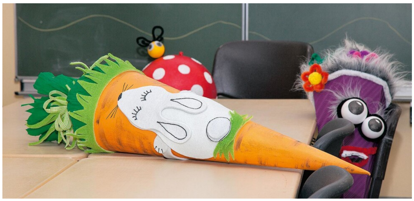
School bag for school enrolment "Rabbit & Carrot