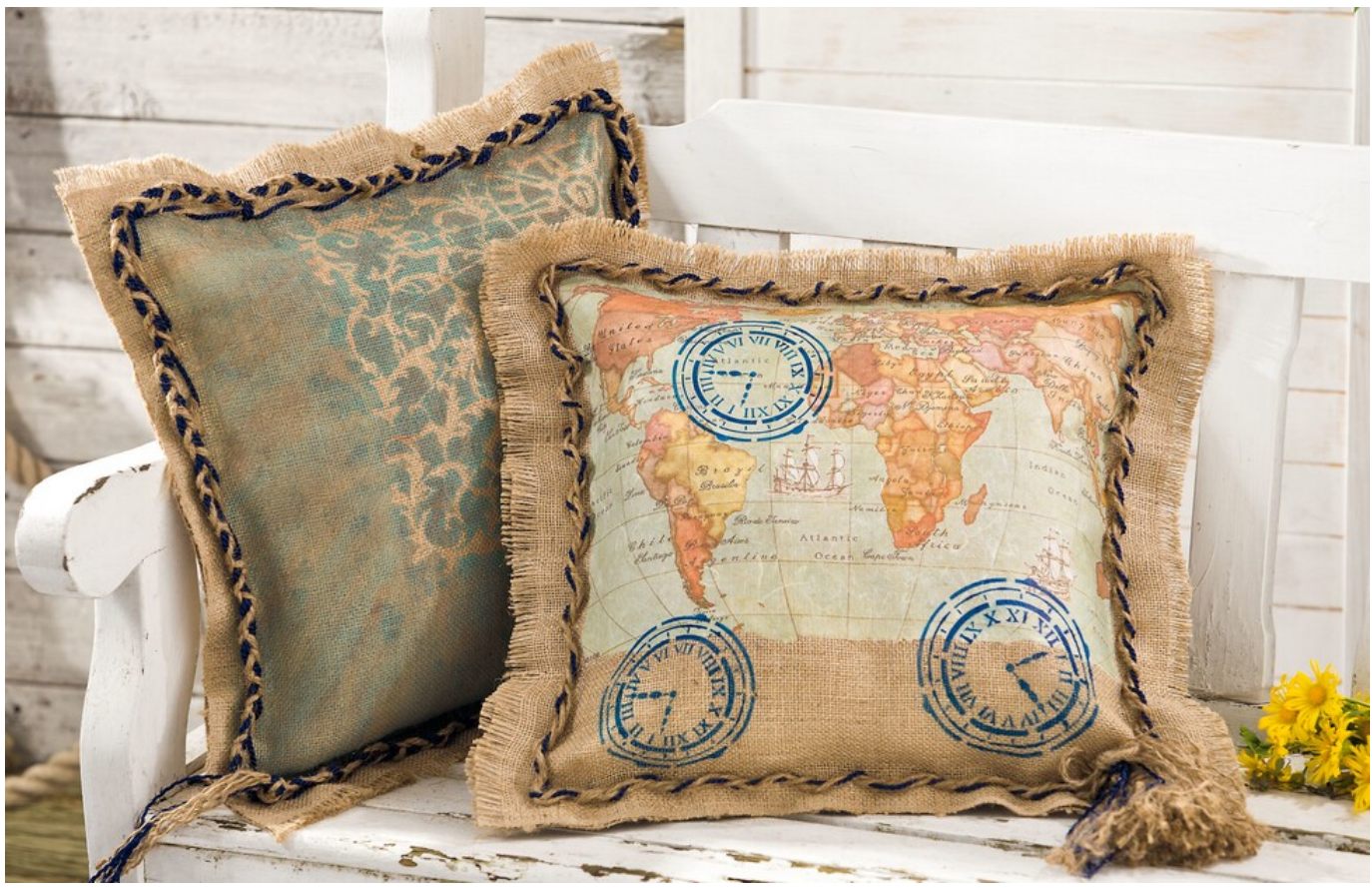
Pillow "World Map"

These creative pillows do not only please globetrotters. They are designed with Motif straw silk and Fabric paint on rustic plucking. The motifs are simply stenciled on.