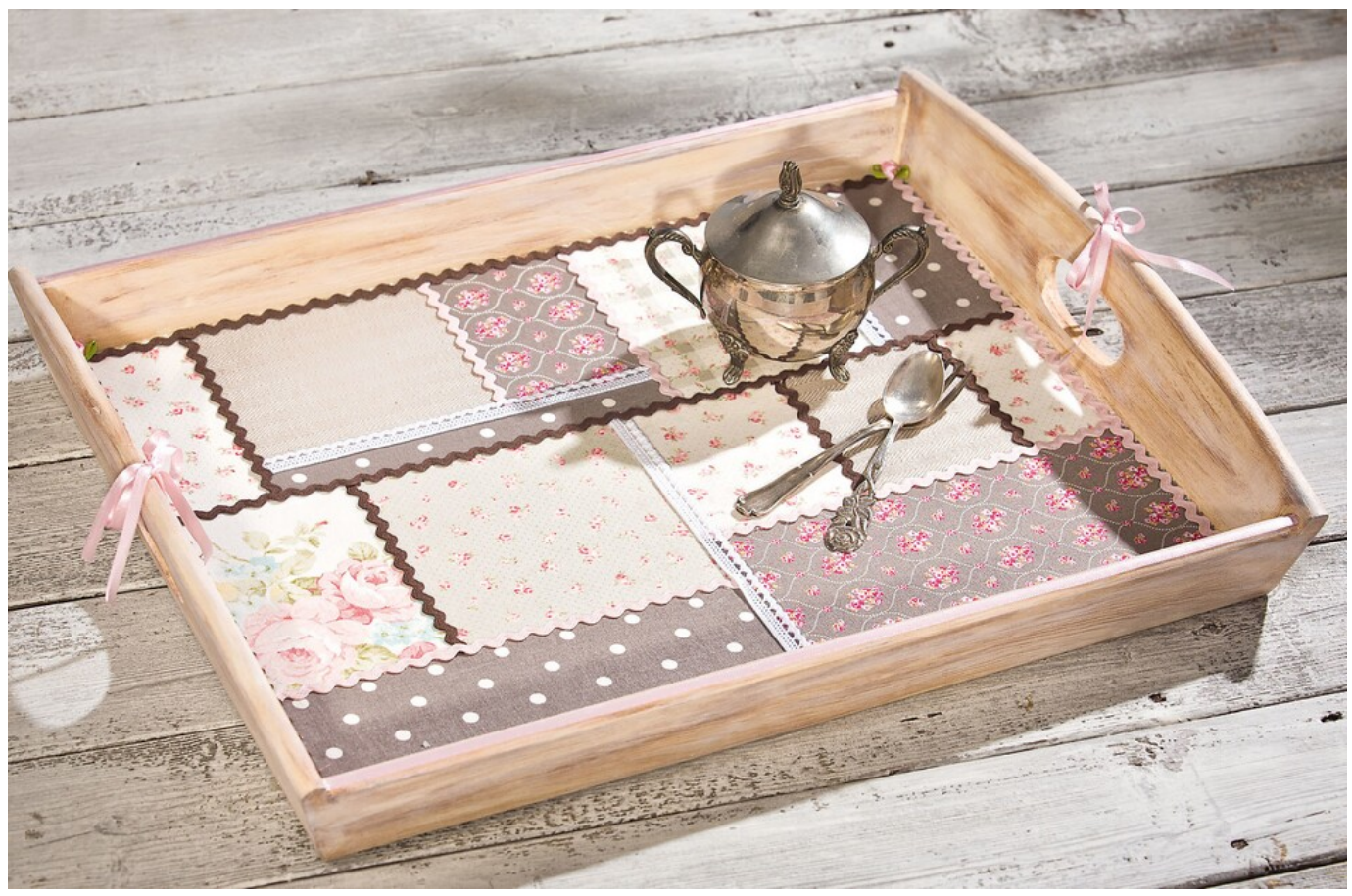
Here's how it works

Fabric is incredibly versatile. You can't only sew it, you can also glue it. Here, different cuts are joined together on a sturdy tray to form a patchwork pattern, the transitions are laminated with ribbons and lace. This gives the large tray an unusual country house look.