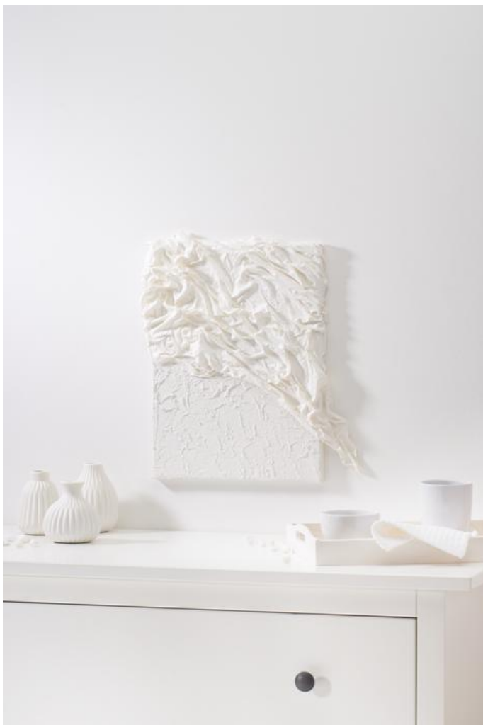
Image relief from modelled fabric

For this structure picture you need a silk cloth in the format 55 x 55 cm. Coat the cloth generously with fabric stiffener. Immediately place it in artistic folds on the stretched canvas to create an exciting 3D look. Leave it to dry for approx. 6 x 8 hours.