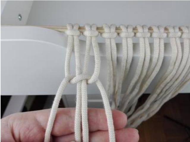
Now reverse: Left cord UNDER the middle ones and OVER the right...