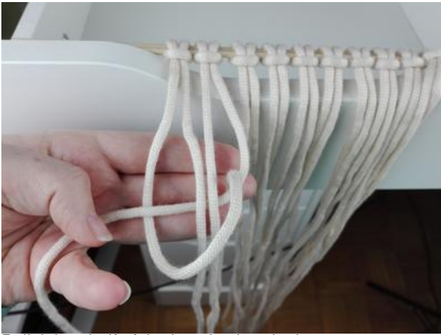
Pull tight – half of the knot is already done.