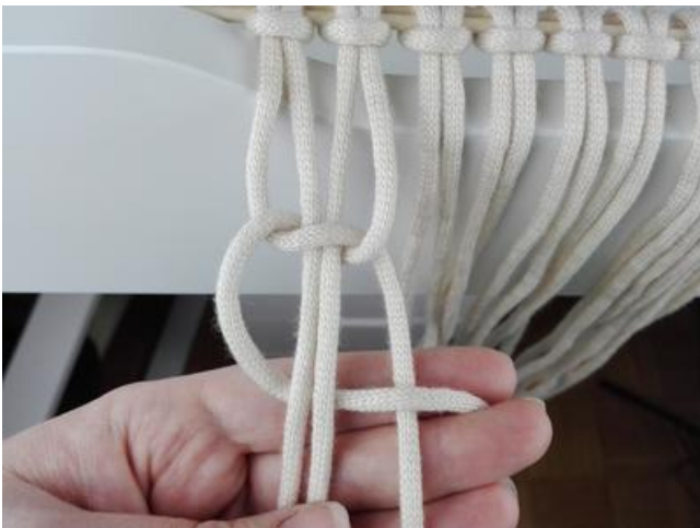
...right cord OVER the middle ones and through the loop to the left. Pull tight – finished! Repeat this knot with the same four cords one more time below.