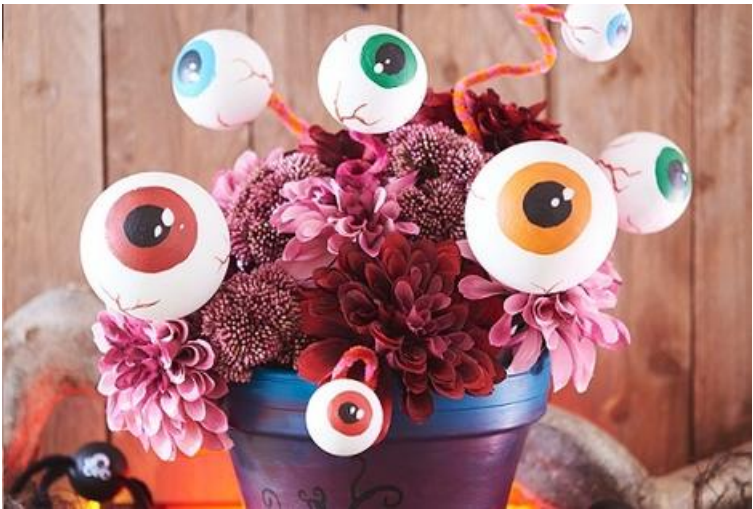
Halloween decoration: creepy styrofoam eyes