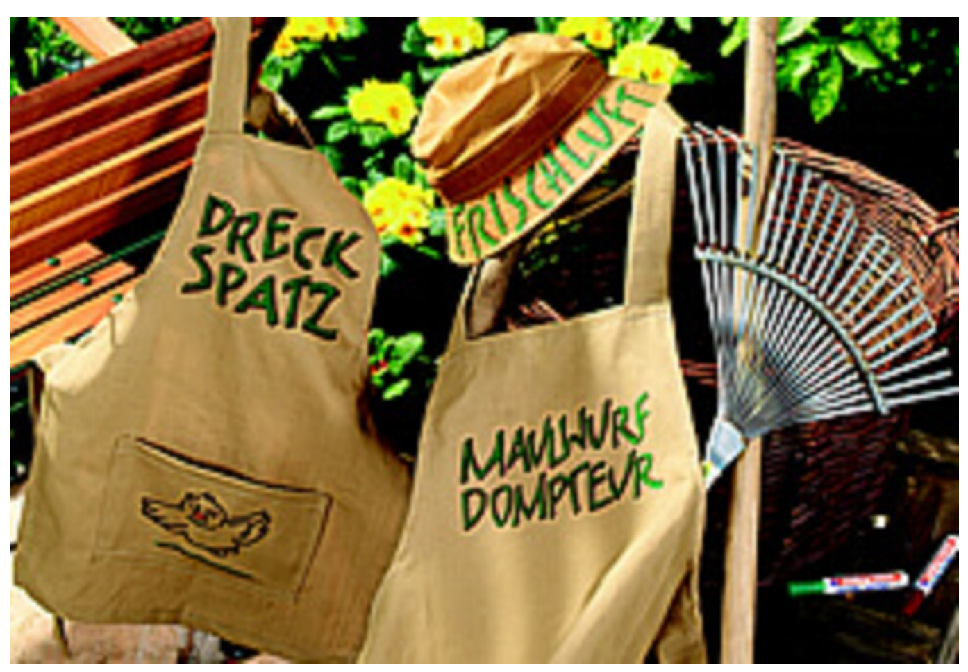
And so it goes

First of all, write the motto on the apron using the edding 4500 textile marker.