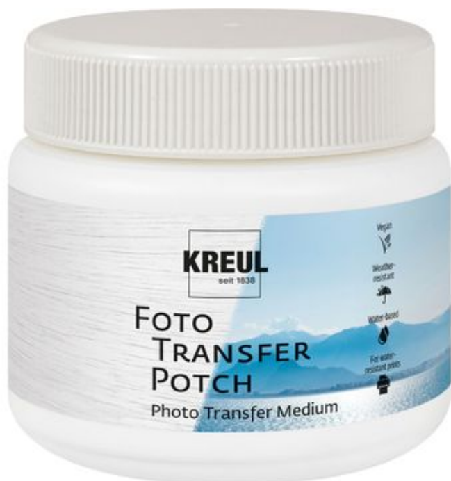
Photo Transfer Potch, 150 ml