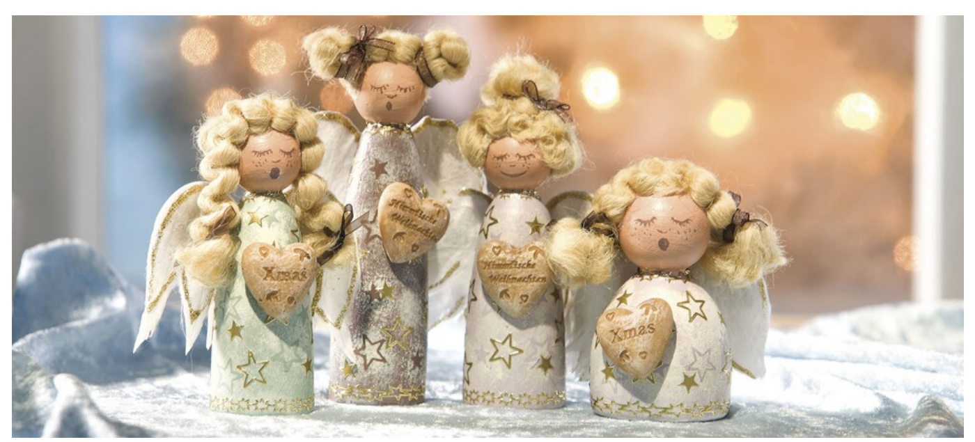
Here's how it's done:

What gift could be more personal than a homemade guardian angel? These cute little dolls symbolise exactly what you want to say to a loved one: Angels should protect you.