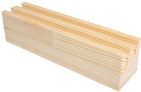
Wooden stand for rings