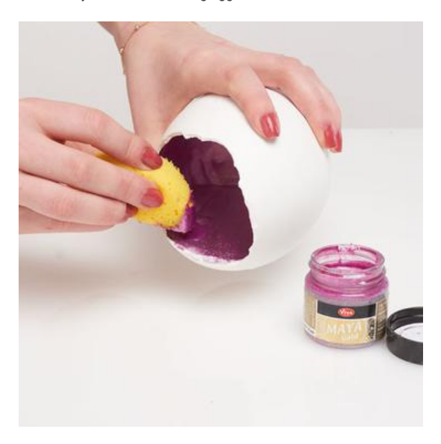
8. apply Metallic colour with the Paint sponge