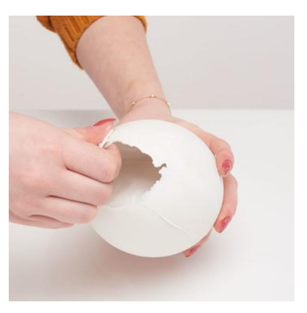
7. Enlarge the egg opening, simply break off "eggshell Finish

The finished cast dino eggs are used for the final Metallic-Look inside with Maya Gold Paint painted. Finally, place an LED tea light in the egg.