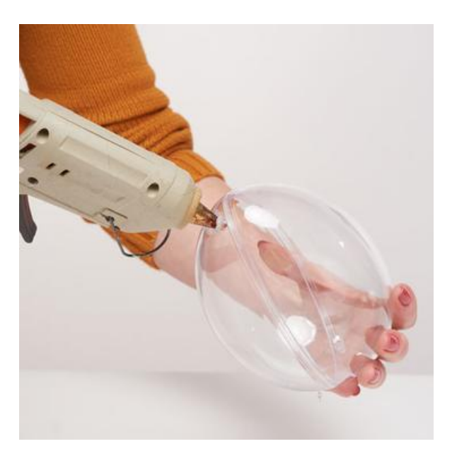
1. Melt the filling hole into the Acrylic egg