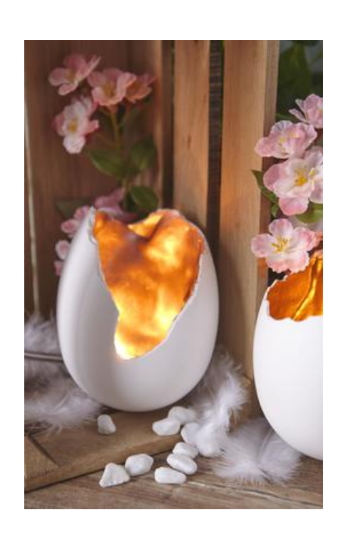
Explained step by step