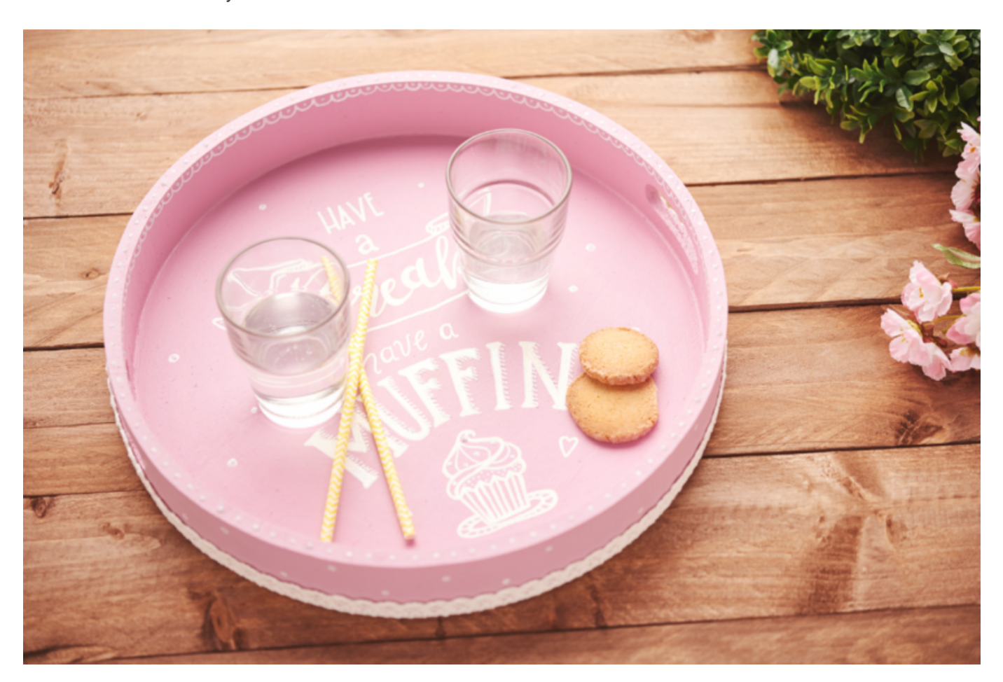
The handlettering on the tray is as simple as this

The round handlettering tray is sure to be the new favourite! With the help of the template, the beautiful muffin motif is drawn by hand.