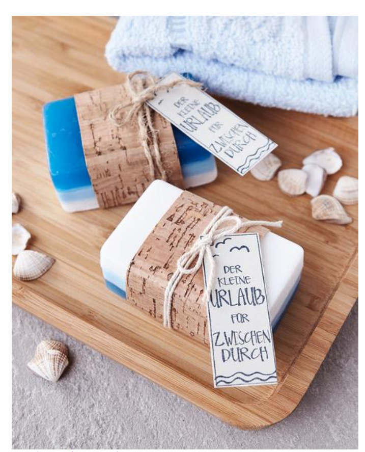
Explained step by step

Put your personal stamp on your selfmade soap! With a noble packaging and a stamped message, giving away soaps is even more fun!