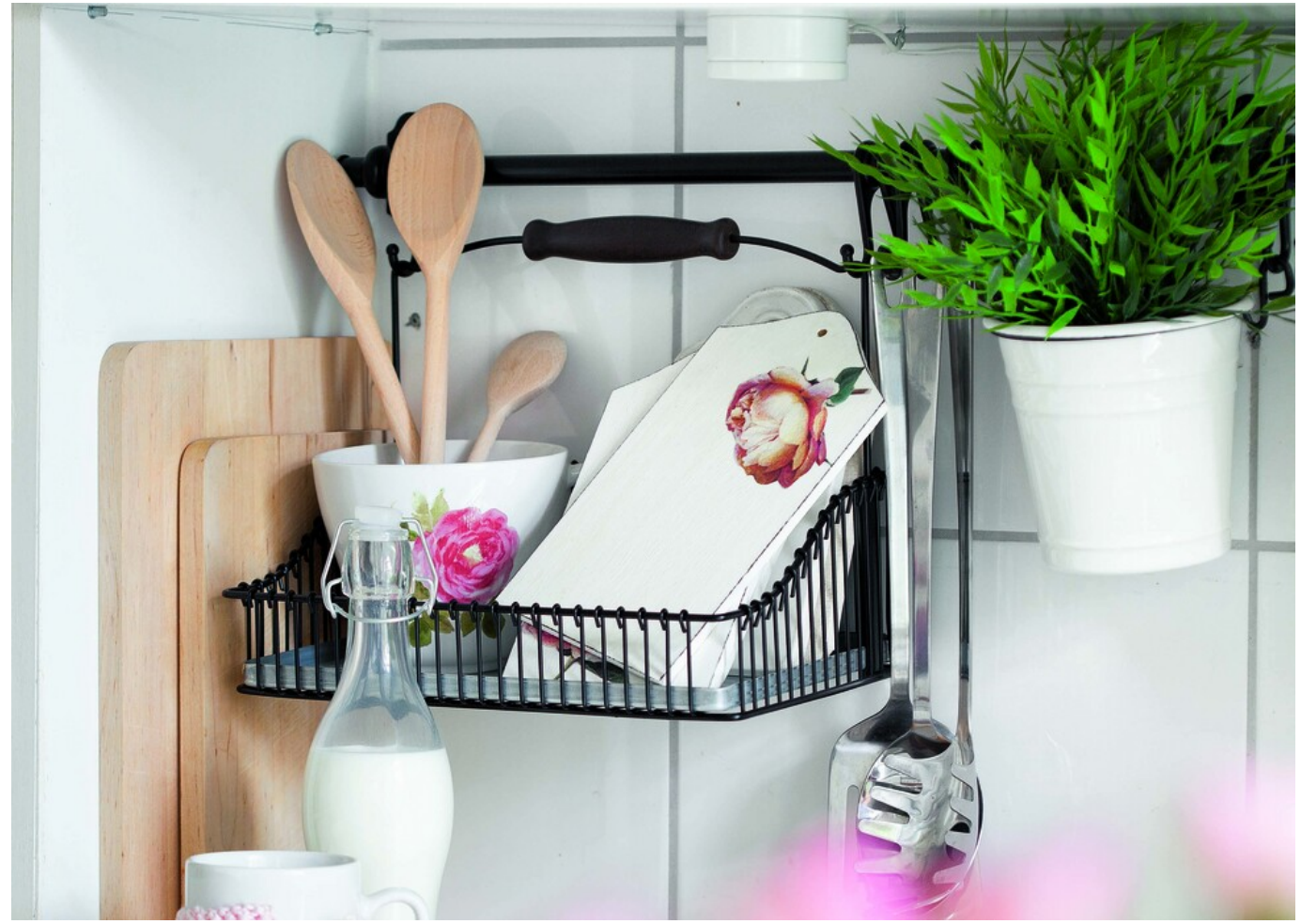
And it's that easy

This set with small breakfast boards forms a beautiful frame for the flower motives of Straw silk paper . Romantically decorated in country house style they are a special eye-catcher on your breakfast table. But if this seems to be a pity, you can also hang the small boards as a picture on the wall and create a small gallery from it.