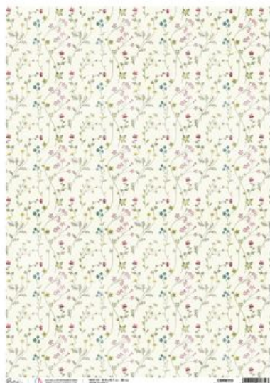
Motif straw silk "Flower Shop - Delights Garden"