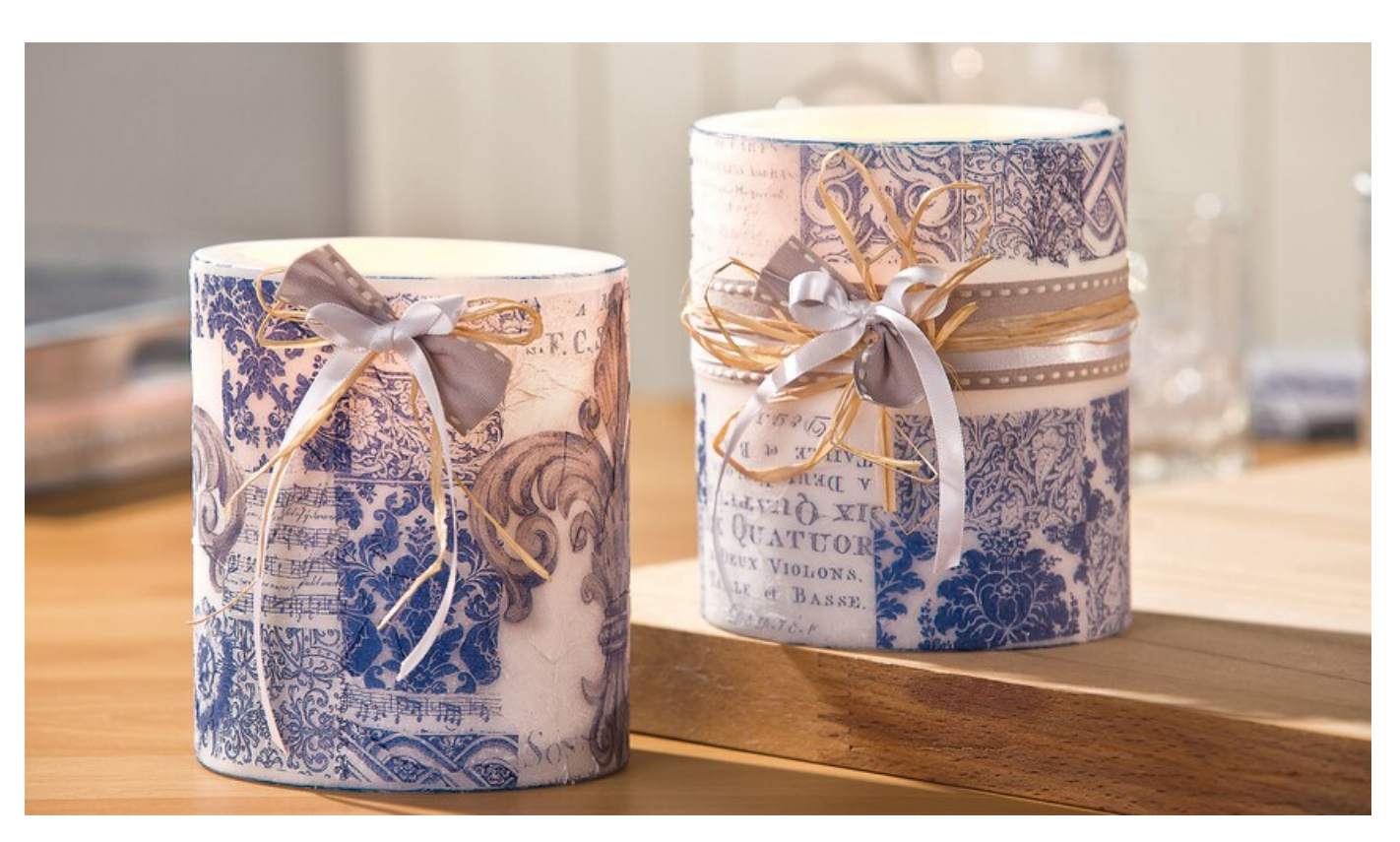
Here's how it works

As a thick wax edge remains when burning down, you can later place a tea light in the remaining shell and thus enjoy the candles for a particularly long time.