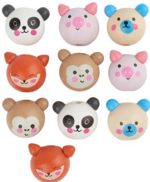
Wooden balls with face "Cute Animals", 10 pcs.