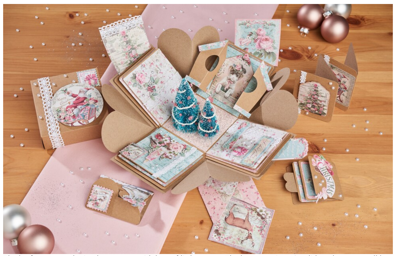
The kraft paper explosion box comes with lots of little extras. The box contains 12 solid pockets, a small box that fits exactly in the middle and 12 decorative elements in different shapes and sizes.

Surprise! This gift box opens like an explosion and unfolds various compartments and layers. The Kraft Paper Explosion Box is a wonderful gift idea for Christmas. In this tutorial, we will give you inspiration on how to create the box for Christmas.