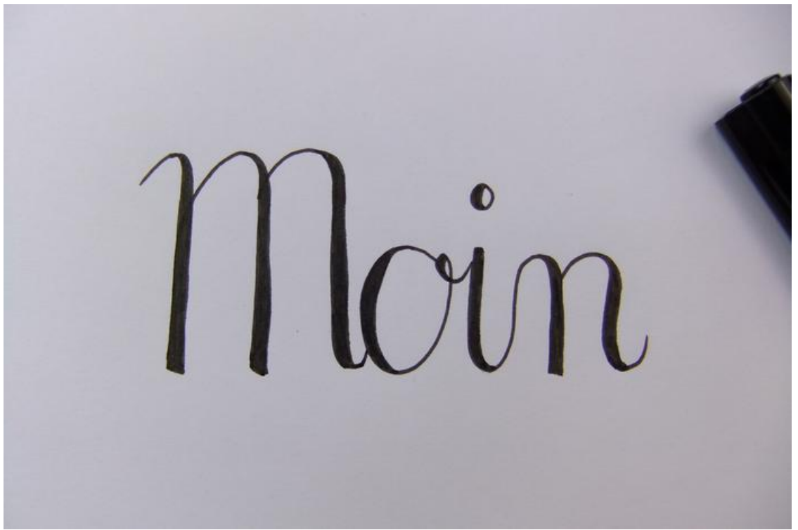
Brush Lettering - Penmanship

Brush lettering captivates with artistically curved letters. Before letting your wrist loose, practice how the brush pen reacts. Apply pressure for downward strokes, draw lightly for upward strokes. Important: the transition should be smooth. Practice individual letters before moving to words. Over time, you'll get a feel for pen handling.