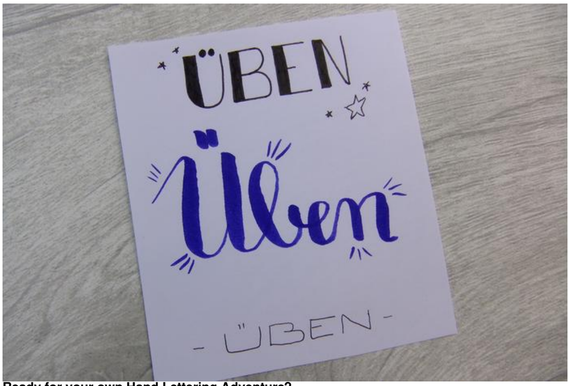
Ready for your own Hand Lettering Adventure?

Visit our Online Shop and discover the complete selection of materials and tools you need to start hand lettering. Begin your creative project today!