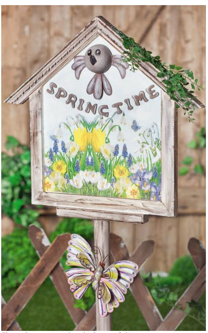
This idea is timelessly beautiful!

Now a fresh wind is coming into your garden! With the Napkin technique and great Metal accessories is this garden plug in no time spring-freshly designed.