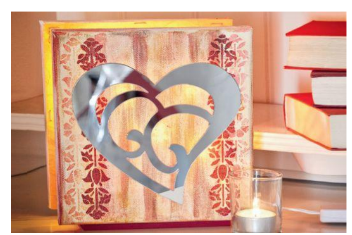
Decorative lighting of a different kind! With dimmed light for a romantic atmosphere..